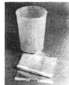
Cup & liners for Spray Guns